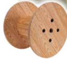
Nailed wood reels